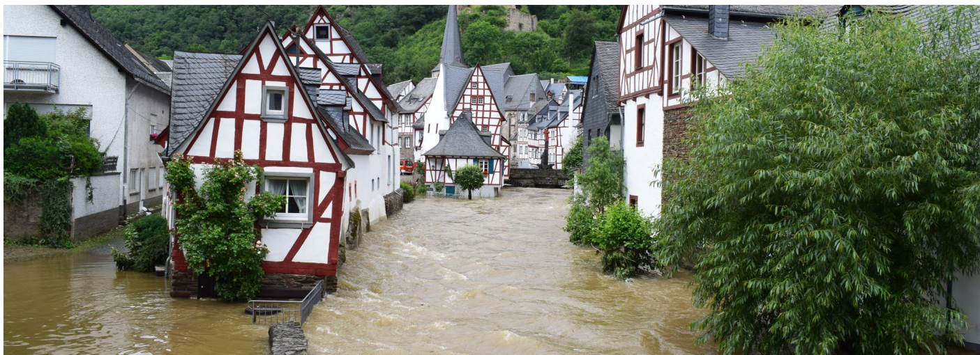
Germany was one of a number of countries around the world to experience extreme weather conditions this summer.