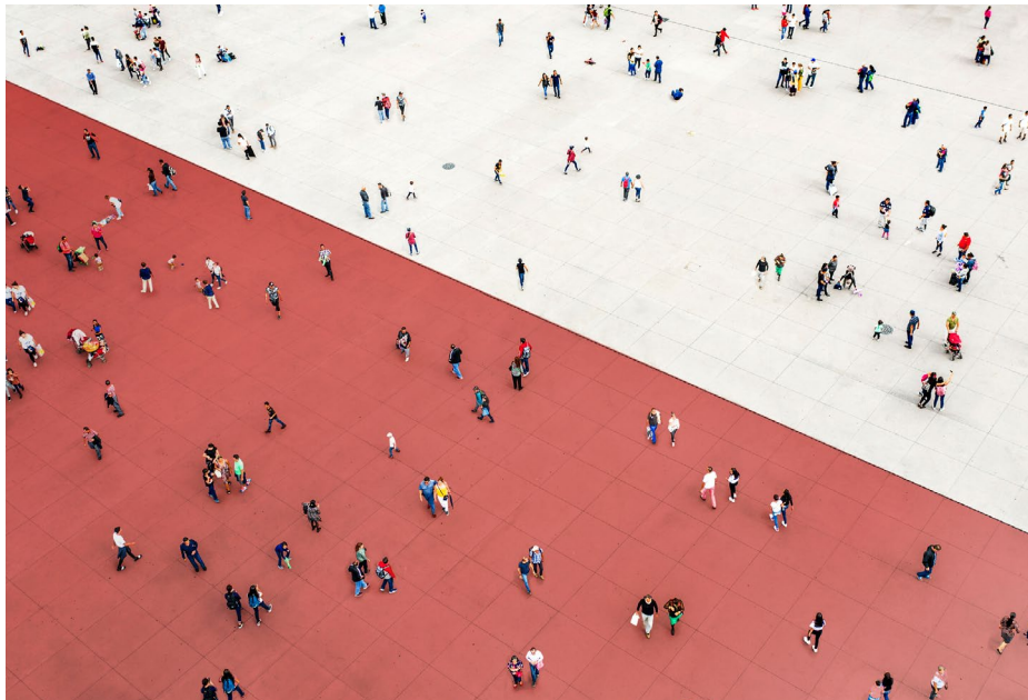
A world divided: differing approaches to Covid-19 have seen some regions significantly lag others.

But unlike in Q1, the market has taken a more pessimistic economic view – fuelled by the rise of the Delta variant – that these strong demand trends will fade into year end and that high inflation is temporary. This resulted in the US 10-year bond yield retracing its lows and a subsequent rotation back into quality stocks which helped the